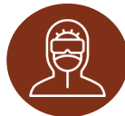
Disposable fluid-resistant coveralls and hair/head covers.