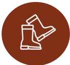
Boots or boot covers.