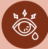
Eye irritation or pink eye ( very common symptom )