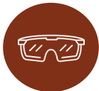
Properly-fitted unvented or indirectly vented safety goggles.

Your employer should provide you with personal protective equipment (PPE) with no cost to you. Use PPE when in direct contact with potentially infected animals or animal products. This is especially important when touching or working in the same building as sick animals. PPE includes: