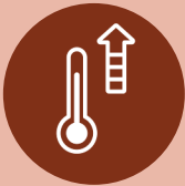
Fever (Temperature of 100°F [37.8°C])

The early signs and symptoms of avian flu are similar to those of seasonal flu. You can have avian flu without having all of these symptoms. Report any symptoms so that you can be tested. The testing will tell you whether you have avian flu.