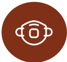
Properly fitted NIOSH-approved respirators, like an